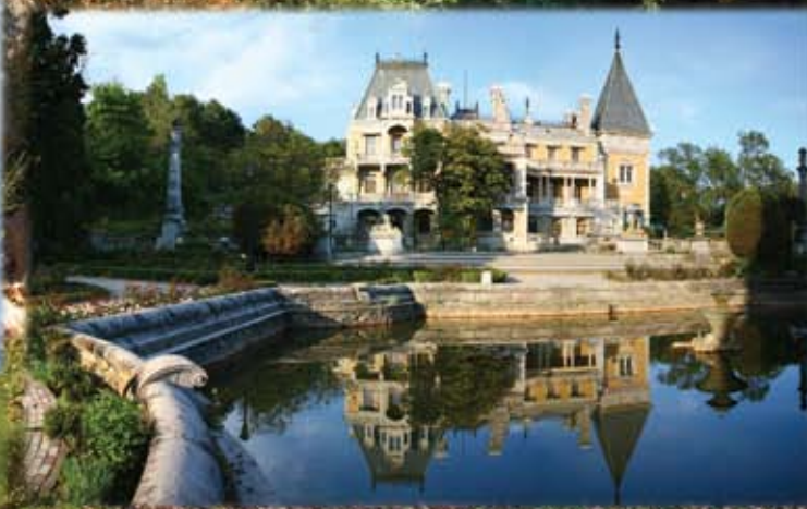
Київський державний академічний театр ляльок, Київ. Верхнє фото справа: Луцький замок, Луцьк. Нижнє фото зліва: Ластівчине гніздо, Ялта. Нижнє фото справа: Невідомий замок. ❖ Kyiv Academic Puppet Theatre, Kyiv. Top: Lutsk High Castle, Lutsk. Above: Swallow's Nest, Yalta. At right: unidentified.